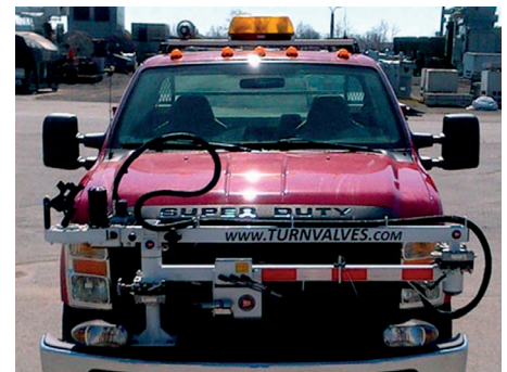
High stack version of the ERV-750 is available for bumper mounting.

*Requires ruggedized HC-100 controller/data logger with built-in GPS, sold separately.