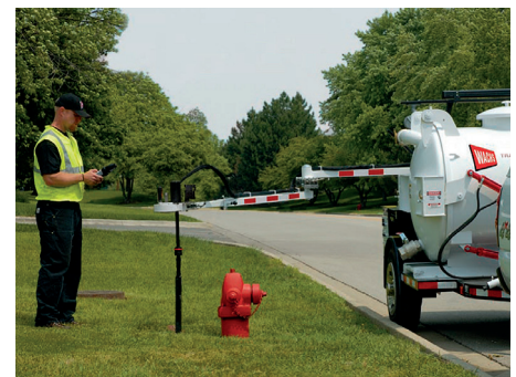
ERV-750 easily reaches any curbside valve box or hydrant within 13ft of the mount.