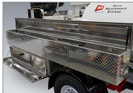
Expanded storage with locking diamond plate watertight job boxes for added security