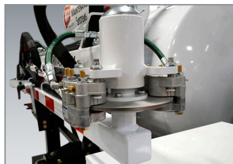
ERV-750 uses unique disk brake system for rigidity, and hydraulic sensors for true hands-free operation