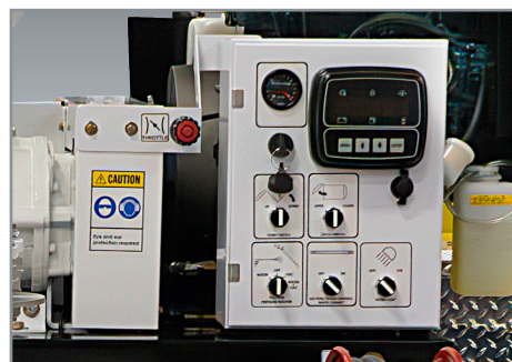
All major systems and operating controls are located curbside for operator safety